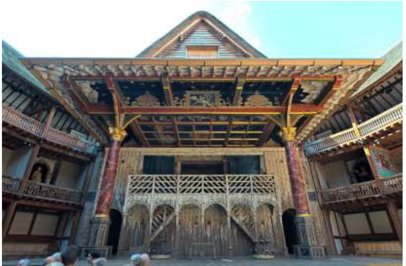
Shakespeare's Globe

At the end of each term, students enrolled in face-to-face and online classes categorized as “lecture,” “seminar,” or “laboratory” are directed to complete an online Student Feedback Survey (SFS). Instructions on how to access the SFS for this course will be sent directly to each student through MavMail approximately 10 days before the end of the term. Each student’s feedback via the SFS database is aggregated with that of other students enrolled in the course. Students’ anonymity will be protected to the extent that the law allows. UT Arlington’s effort to solicit, gather, tabulate, and publish student feedback is required by state law and aggregate results are posted online. Data from SFS is also used for faculty and program evaluations. For more information, visit www.uta.edu/sfs .