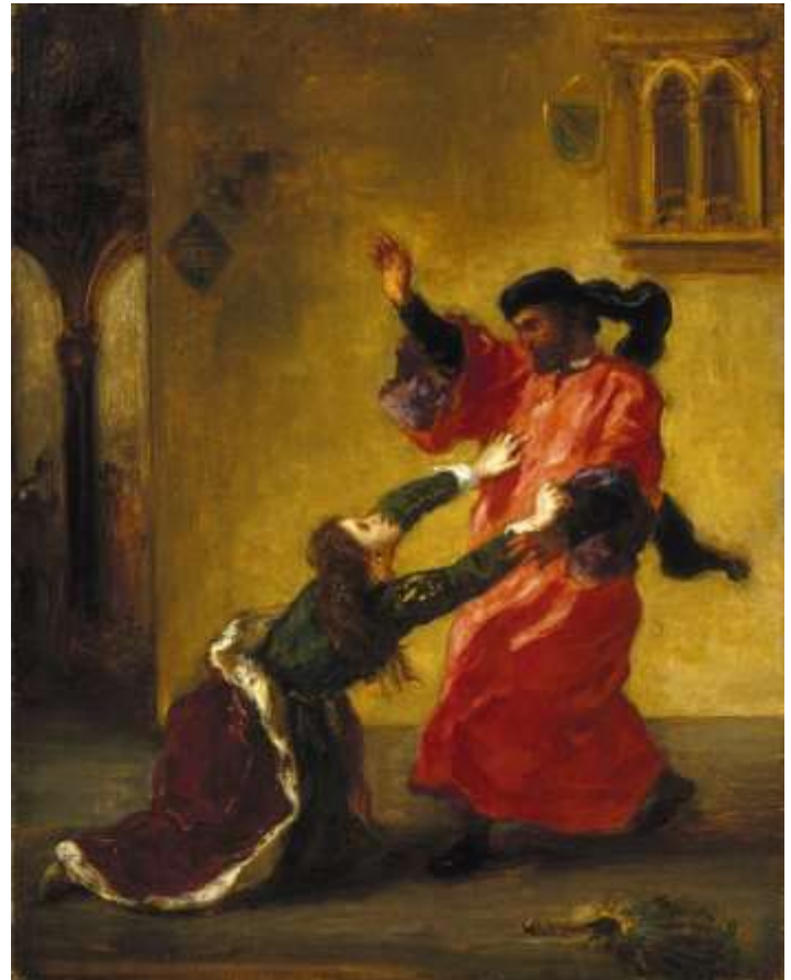
Desdemona Cursed by her Father by Eugene Delacroix (1850-4)

In addition, you must complete a Research Consultation (see below under Library & Research Assistance ) and have the Librarian or Research Coach sign the Research Consultation Form (at the very end) to avoid a -10 penalty on your Term Paper grade. You will submit a hard copy of this form in class on the due date for the Term Paper.