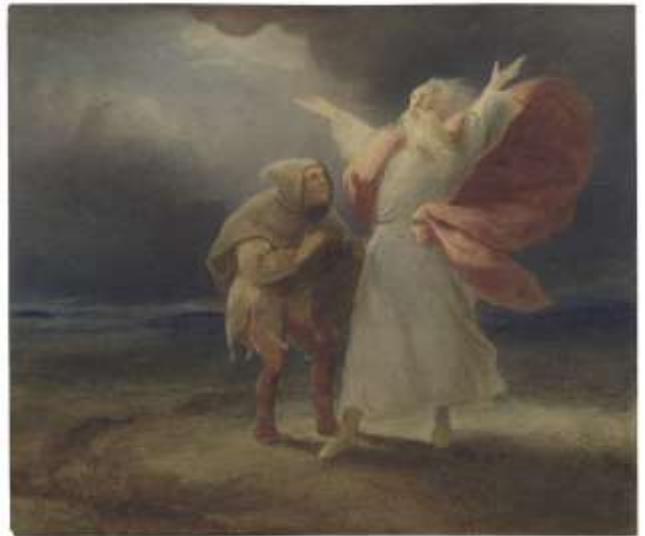
A watercolor of Lear and the Fool from 3.2 (1834) by Ary Scheffer

I will not accept any late assignments for credit. Late work earns a zero for a grade. No exceptions. If you know you will miss class, then you are still responsible for submitting your assignments on time. Similarly, I will not give make-up quizzes or exams except in instances of excused university absences for the exams, but you must schedule alternative exam arrangements with me in advance of the exam dates.