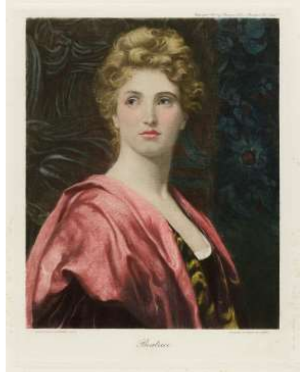
Beatrice from The Graphic Gallery of Shakespeare's Heroines (1896)

We will also have additional readings available via Blackboard.