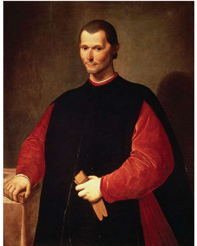
Portrait of Machiavelli by Santi di Toto (sixteenth century)

A. Look at the cover page of this syllabus.