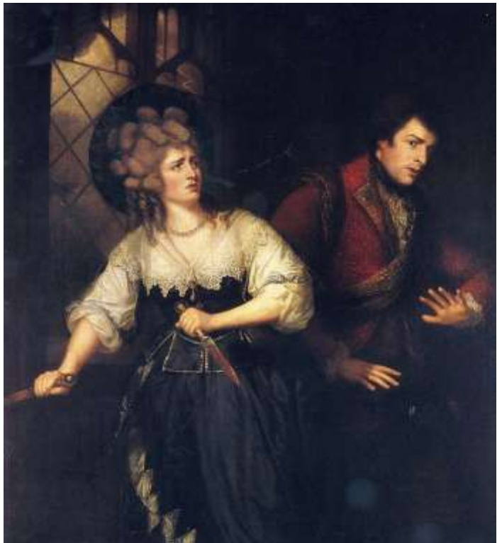
Sarah Siddons and John Phillip Kemble, in "Macbeth" by Thomas Beach (1786)

A pearl is a half-page (300-350 words), single-spaced, 1/2" margin short argumentative essay that tasks you to form an argument on some aspect of the reading due during the week your pearl is due. I will put you into one of four groups (A-D) that determine only your due dates for your three pearls. The pearls are not group assignments: they are not collaborative . Your group assignment merely determines when your pearls are due and what they are over. Pearls are due on Mondays by noon on Blackboard unless otherwise specified below. I may ask you to talk about your pearl in class, so please be prepared. See the supplemental document on Blackboard on Pearls. I average your pearl grades together and drop the lowest one.