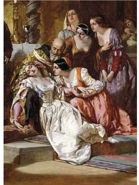
Detail from Depiction of the Church Scene in Much Ado about Nothing (1846) by Alfred W. Elmore

If you are an armed forces reservist and you are called to active duty or otherwise have a schedule conflict, I need to see documentation in a timely manner that acknowledges your service commitment.