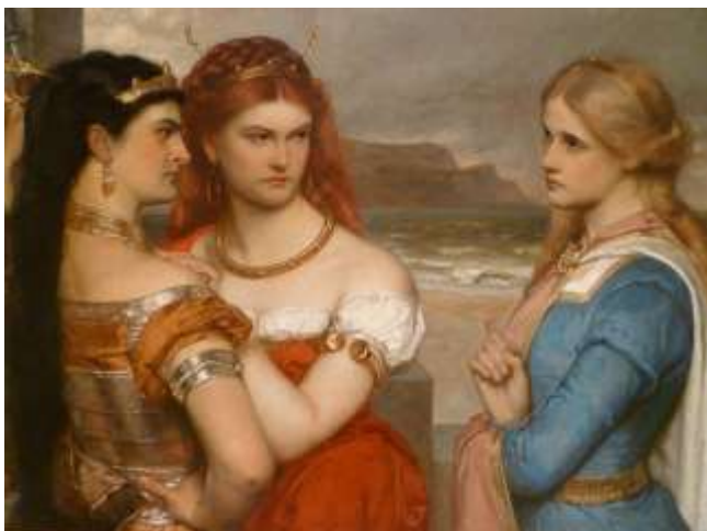
The Three Daughters of King Lear (1875-6) by Gustav Poné

students are prohibited from engaging in or attempting to engage in conduct, either alone or in concert with others, that is intended to obstruct, disrupt, or interfere with, or that in fact obstructs, disrupts, or interferes with any instructional, educational, research, administrative, or public performance or other activity authorized to be conducted in or on a University facility. Obstruction or disruption includes, but is not limited to, any act that interrupts, modifies, or damages utility service or equipment, communication service or equipment, or computer equipment, software, or networks. (UTA Handbook of Operating Procedures, Ch. 2, Sec. 2-202)