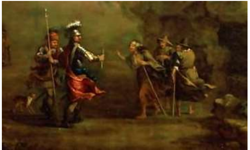
Detail from Macbeth and Banquo Meeting the Weird Sisters by John Wootton (1682-1764)

Scholastic dishonesty includes but is not limited to cheating, plagiarism, collusion, the submission for credit of any work or materials that are attributable in whole or in part to another person, taking an examination for another person, any act designed to give unfair advantage to a student or the attempt to commit such acts" (Regents' Rules and Regulations, Series 50101, Section 2.2)