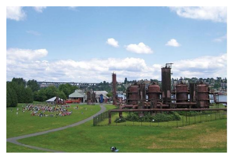
Figure 2: Seattle, Washington: Gas Works Park showing covered picnic areas and interpretive pavilions on left, open space, and former gas generating towers on right

Haag chose to preserve several of the original components of the factory site, calling them "a memorial to Rube Goldberg engineering."<sup>ix</sup> As possible uses for the most iconic elements of the park, the six large gas generating towers, Haag envisioned "… a walk-in cloud chamber, a camera obscura, planetarium, vertical museum, tactile chamber, exploratorium,