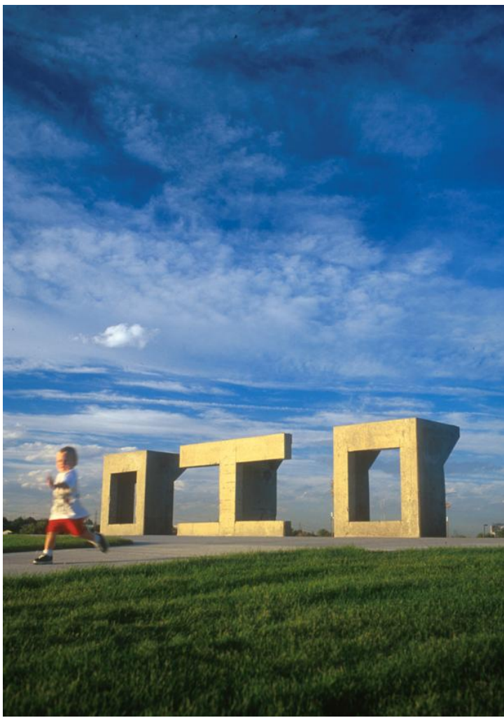
Figure 7: defamiliarized creative elements created by subtraction with huge horizon