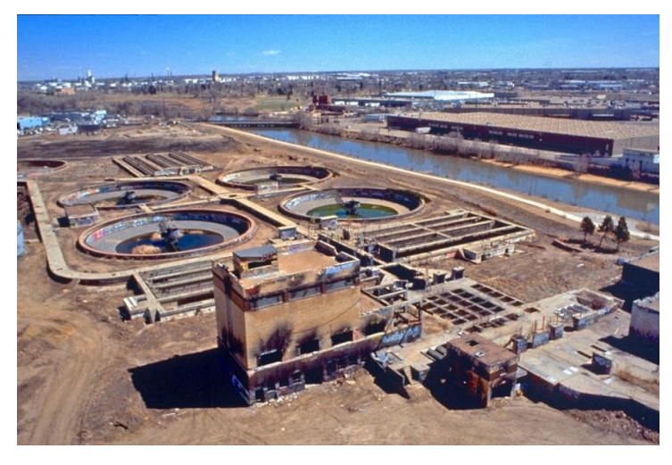
Figure 4 Denver, Colorado: decommissioned sewage treatment plant-