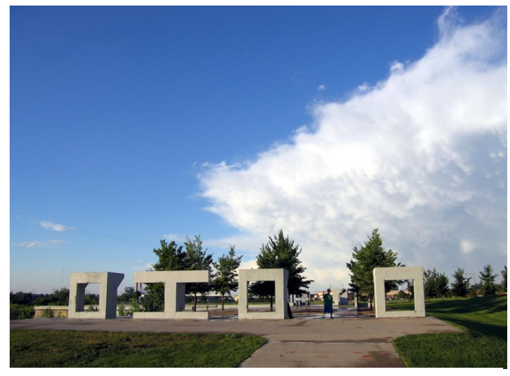
Figure 8 local teenage boys showing the scale of the structures and interacting with the photographer

A more predictable and less creative solution for reuse of settling tanks was designed at Landschaftspark Duisburg Nord in Germany. This world famous example of the industrial picturesque keeps the settling tanks intact as preserved expressive picturesque landscape elements. The contrast between Northside Park and Duisburg Nord clarifies the contrast between the ethos of looking backward and the ethos of looking forward with expressive echoes of the past. The result is a unique park experience that builds on the cultural and picturesque precedents of Gasworks Park by creating a personal creative interpretation at Northside Park of the industrial past.