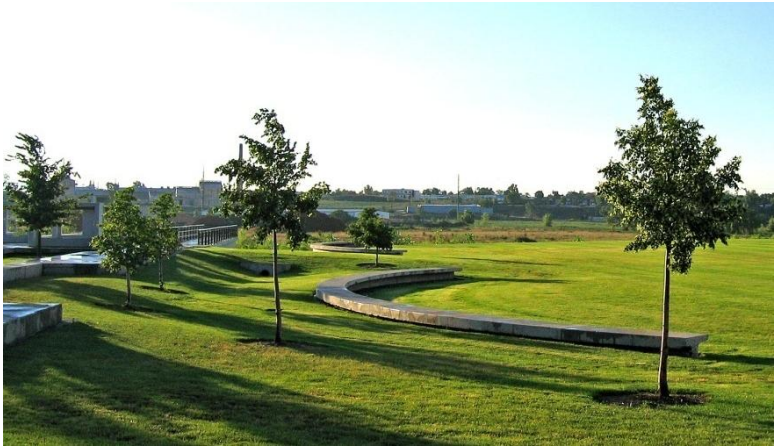
Figure 9-curved benches at edge of new soccer fields created from edges of former settling basins

a. An embrace of regionally defining physical, environmental, social and cultural elements; The expressive industrial forms are creatively reused, the flat topography of the site is celebrated, and the regional context of the Rocky Mountains, other industrial users in the area, and the city of Denver are a strong part of the experience of the place.