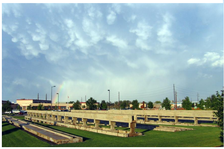
Figure 6: defamiliarized creative elements

Figure 4 shows the treatment plant prior to construction. It is easy to imagine how the strong picturesque forms of the existing structure could have been the driving design determinants. Figure 5 shows how the design has transformed the treatment plant into an entirely new landscape with passive and active programmatic elements, environmentally future viable features, and expressive forms that echo its industrial past.