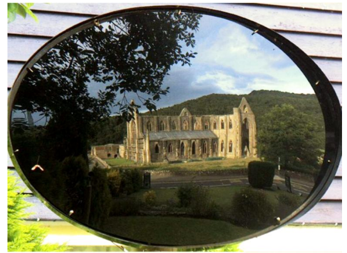
Figure 1: Tintern Abbey on the Welsh/English Border as projected by Claude Glass and captured by webcam. Installation by C. S. Matheson and A. McKay.

The picturesque is an element of detached aesthetics, focused on the visual, as opposed to the engaged or fully experiential model.<sup>iii</sup> Picturesque means literally "picture like" and indicates a mode of appreciation by which nature and culture are imagined as artistic scenes. At the height of the movement in the 18<sup>th</sup> and 19th centuries, gentlemanly contemplative observation would be undertaken both with the unaided eye and with a 'Claude Glass'. The small, blackened pocket mirror, named after the artist Claude Lorraine, reduced the tonal values of whatever landscapes it was pointed to as its convex shape simultaneously brought more of the scene into focus. The observer saw only picturesque scenery and ignored other aesthetic concerns as, for example, the squalor of the rural poor.<sup>iv</sup>