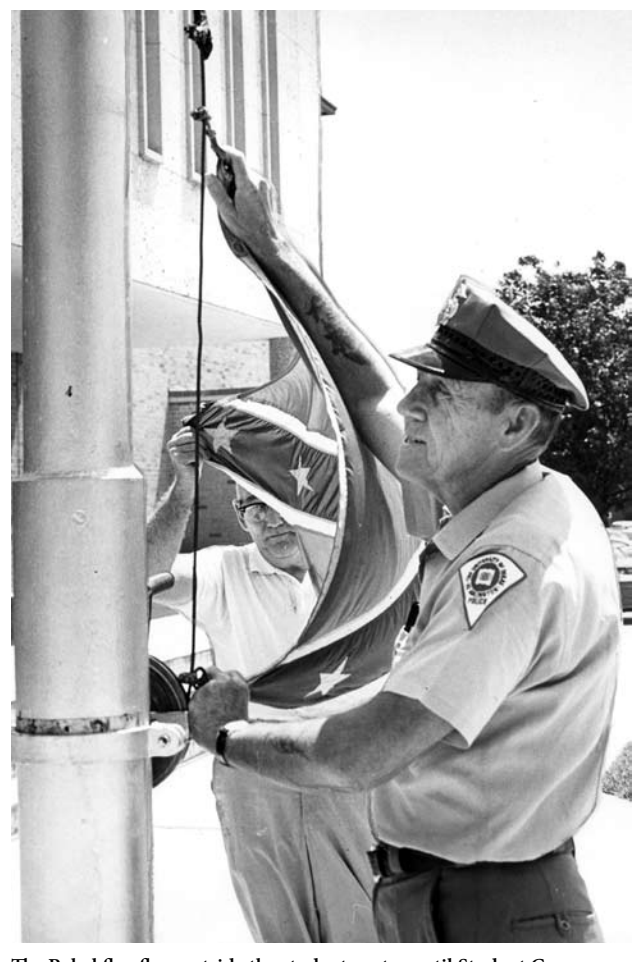
The Rebel flag flew outside the student center until Student Congress decided to permanently remove it. Here, the flag comes down for the last time, June 30, 1968.