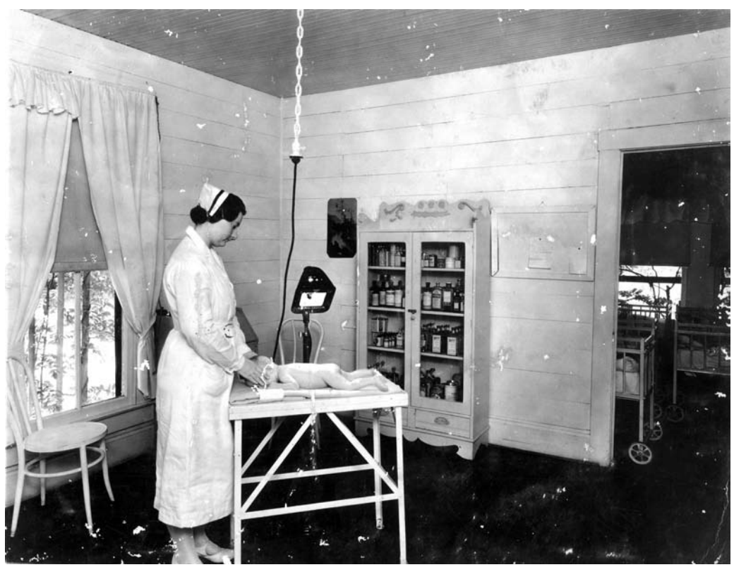
The Rest Cottage delivery room and nursery circa the 1940s.

up to two years for a child. Licensed as a maternity home and child-placing agency by the State of Texas, Rest Cottage caseworkers placed their wards with evangelical Christian adoptive couples who not only met state requirements but passed their rigorous scrutiny.