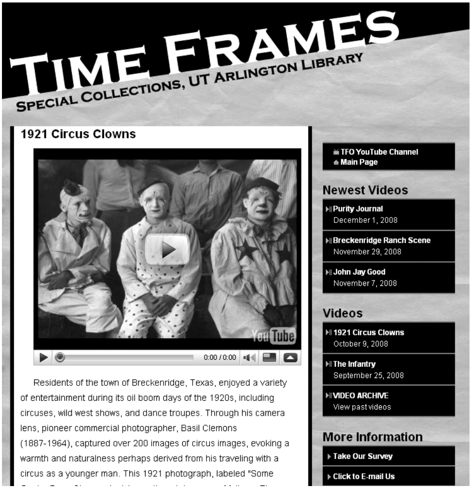
1921 Circus Clowns

The TFO project team creates two new episodes a month. In the videos, the camera pans across the photos, maps, or documents, animating the still images while a narrator describes the scene. Throughout, close-ups show important