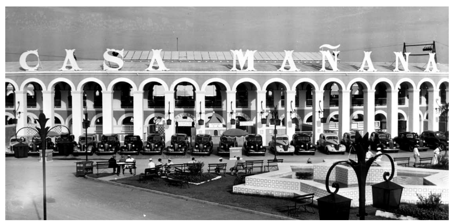
Casa Mañana in 1936.